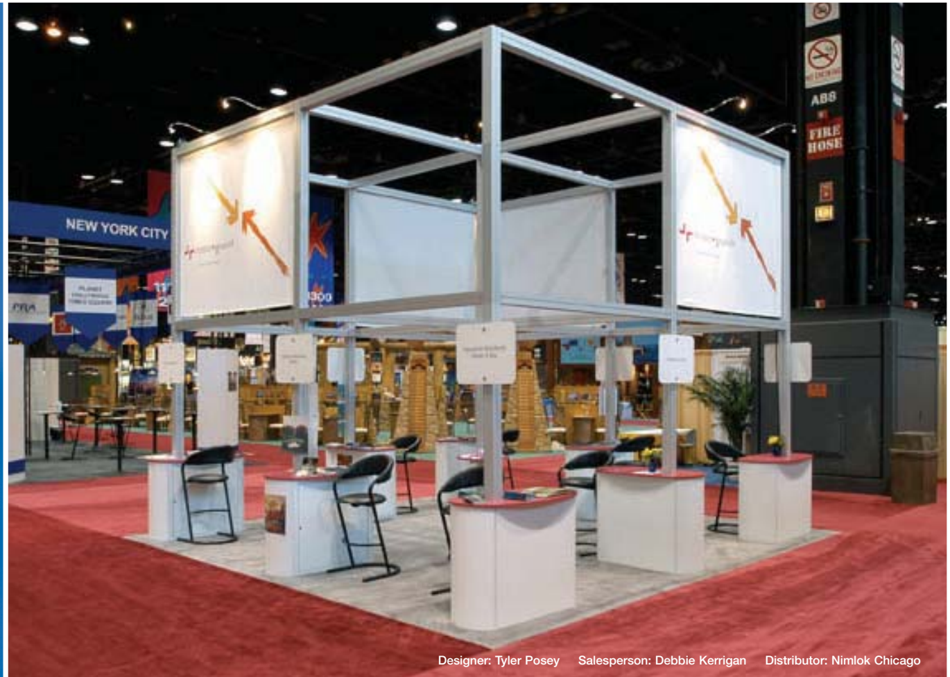
Designer: Tyler Posey Salesperson: Debbie Kerrigan Distributor: Nimlok Chicago

To keep the cost down, Nimlok designed a modern rental that incorporated all the required elements. Aluminum extrusion was utilized in a very simplistic yet contemporary arrangement. Fabric graphics were printed with the hinton + grusich logo and hung at the highest point of the booth. Within the 20 x 20 space each hotel partner was given its own signage with their name displayed and a counter work station. Each work station was placed on the outer edge of the booth in order to create equal exposure to the show floor. The exhibit was designed with an open-floor plan which allowed for easy mobility and constant traffic.